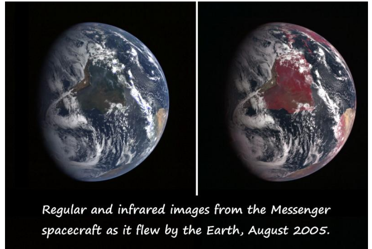
Regular and infrared images from the Messenger spacecraft as it flew by the Earth, August 2005.

I take the life and teachings of Jesus earnestly; and Hymn 682* sets me to respond to Christ's love that frees me to live in the world and offers hope for the world we live in. (* The Hymnal 1982) †